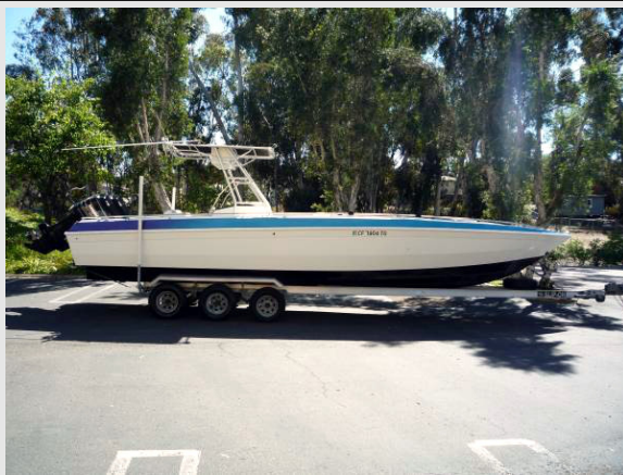
Model: 1988 311 Location: La Mesa, CA Asking Price: $27,500

Boat Hull is pretty clean, Imron paint two years prior to me buying her in 2013 (per previous owner), set up for SBC twins and alpha drives, off- color repaint spot, stbd side above rub rail. DOES NOT INCLUDE ENGINES, but includes drives, bennet tabs, all cables, rigging and harnesses in place. has drop down bolsters with adjustable headrests, but the upholstery is SHOT. the top edges are all split from sun and exposure ( prior to me owning it), no back seat and no sunpad cushions. cabin cushions are intact and upholstery is good. through-hull exhaust and integral swim platform. Chris Craft also puts the HIN on the hull itself so you can run it with the platform removed. Includes Boatmaster aluminum double axle trailer, needs new brakes, tires good, 6 lug wheels. I'm open to offers and possible trades (work van?) ( big Blocks?). she needs some work but I also restore these and i know what a great boat she will be again, i just happen to own several Stingers and i need to let one or two go.