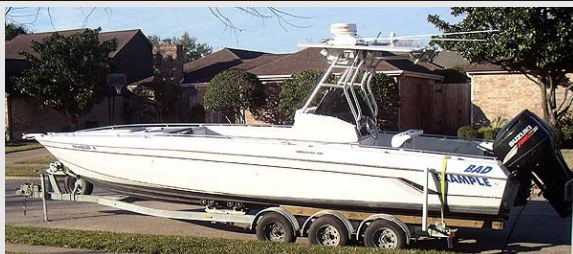
Model: 1988 311 Location: Surfside Beach, TX Asking Price: $14,500

31 FEET LONG CENTER CONSOLE FISHING BOAT SOLID HULL IN GREAT SHAPE NO CRACKS BLEMISHES OR SOFT SPOTS, NONE LIKE IT, BRAND NEW CUSHIONS, BRAND NEW WIRING BATTERIES SWITCHES GAUGES FUSES FRESH BOTTOM PAINT. TRIPLE AXLE ALUMINUM TRAILER VERY LIGHT STURDY. TWO YAMAHA 200HP OUTBOARDS FULLY SERVICED TOP TO BOTTOM STAINLESS STEEL PROPS hull trailer and motors all 1988.