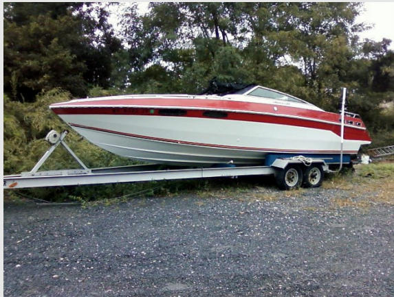
Model: 1988 260 Location: Kingston, NY Asking Price: $4,500

Boat Hull is pretty clean, Imron paint two years prior to me buying her in 2013 (per previous owner), set up for SBC twins and alpha drives, off- color repaint spot, stbd side above rub rail. DOES NOT INCLUDE ENGINES, but includes drives, bennet tabs, all cables, rigging and harnesses in place. has drop down bolsters with adjustable headrests, but the upholstery is SHOT. the top edges are all split from sun and exposure ( prior to me owning it), no back seat and no sunpad cushions. cabin cushions are intact and upholstery is good. through-hull exhaust and integral swim platform. Chris Craft also puts the HIN on the hull itself so you can run it with the platform removed. Includes Boatmaster aluminum double axle trailer, needs new brakes, tires good, 6 lug wheels. I'm open to offers and possible trades (work van?) ( big Blocks?). she needs some work but I also restore these and i know what a great boat she will be again, i just happen to own several Stingers and i need to let one or two go.